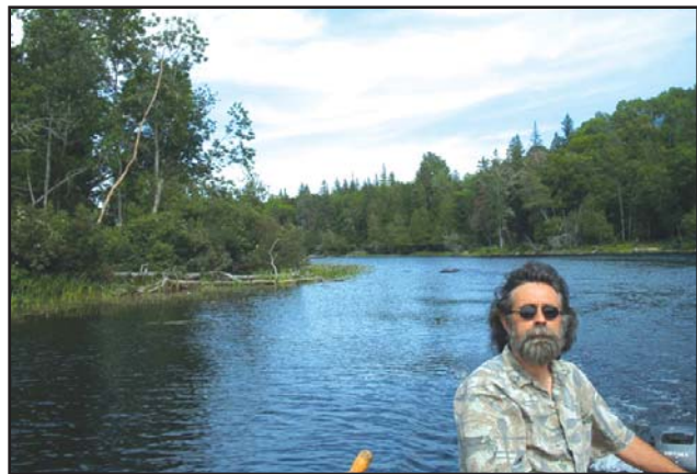
The Picanoc River contributes to the local economy by attracting fishing and boating enthusiasts, with negligible environment impact

The traffic problem could only be improved by relocating the processing of the garbage closer to the source, ie: the city of Gatineau. Lechate, ground water contamination, seagulls and vermin could be completely eliminated by using the most modern and efficient method of garbage disposal available – plasma gasification. This method would immediately dispose of refuse and simultaneously produce electricity. At the same time, the tourist industry and vacation property values on which the local economy and municipalities depend would be protected.