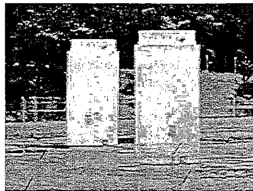
Used Nuclear Fuel Storage Containers

For the vertical concrete-encased steel containers, two impact points were evaluated. One evaluated a mid-plane impact to create maximum deflection.