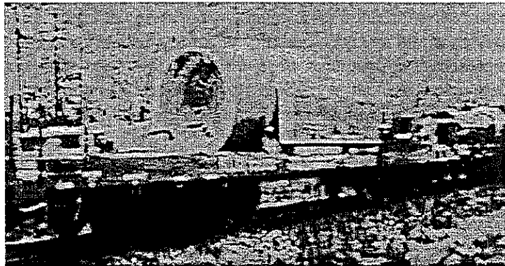
Container for Transporting Used Nuclear Fuel

The analyses show the container body withstands the impact from the direct engine strike without breaching. The forces on the container are comparable to the forces used in tests containers must undergo before designs are approved by the NRC. Additionally, the container remains attached to the rail car and the rail car does not tip over. Because the fuel transport container is not breached, there would be no release of radionuclides to the environment.