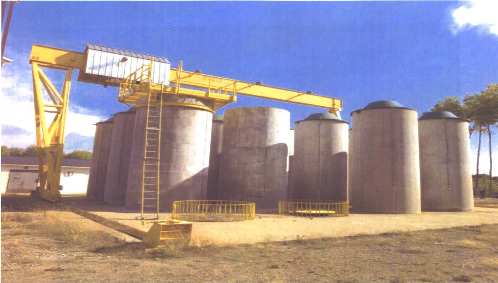
Figure 4. Chalk River Current Silo Array.