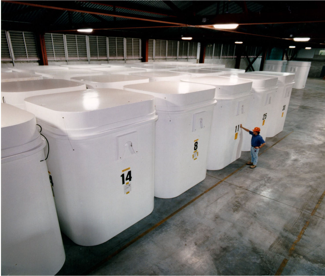
Figure 9. Pickering Existing Cask Storage.