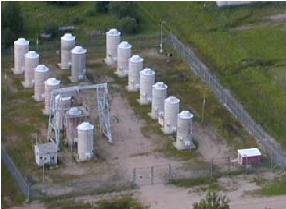
Figure 10 – Whiteshell Laboratories Current Silo Array