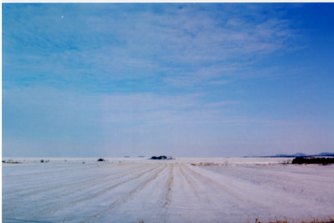
Photo 14b From the shore near Kamouraska, looking west towards Pointe-aux-originaux, January 15, 2003..