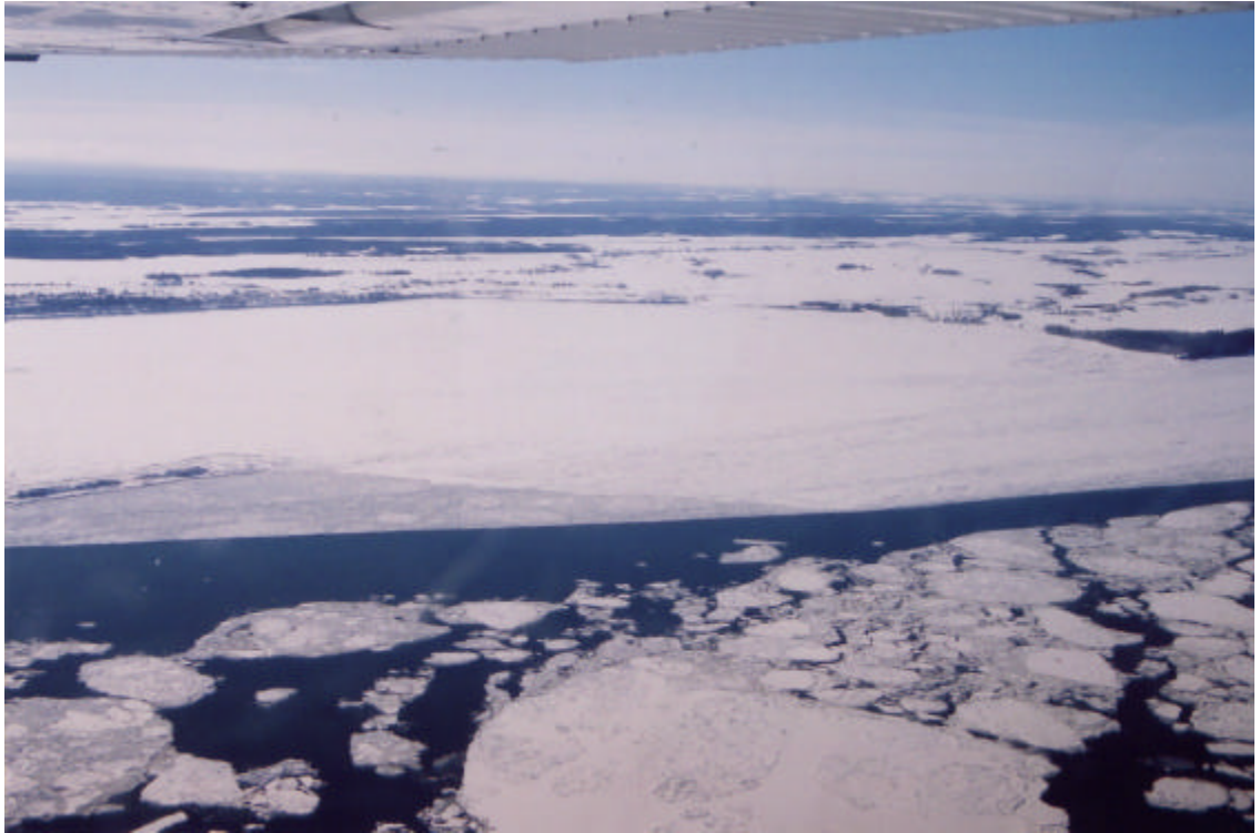
Photo 16 Aerial view of Kamouraska Islands, from the middle of the St. Lawrence, March 6, 2003.