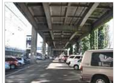
The view beneath the viaduct, facing south