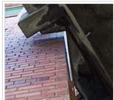
The cutout of the Viaduct is just one of several unique features of the structure