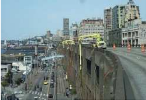
Crews atop the Alaskan Way Viaduct repair earthquake damage in April 2001.