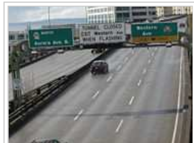
Western Ave Exit to Belltown.