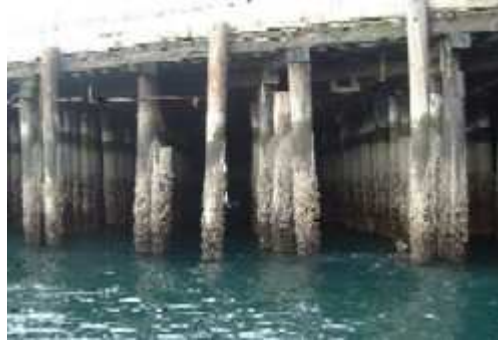
The deteriorating Alaskan Way Seawall, which was completed in the 1930s.