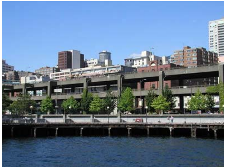
The Alaskan Way Viaduct, as seen from Elliot Bay.