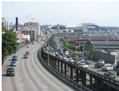
The Alaskan Way Viaduct, looking southeast