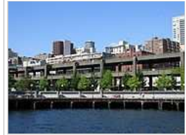
The Alaskan Way Viaduct seen from Elliott Bay