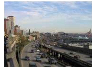
Looking south onto the Alaskan Way Viaduct.